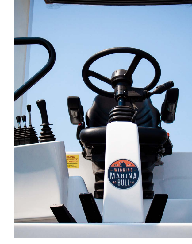
OPERATOR CONSOLE Ergonomic console with

Visibility, sensors, cameras, engineered monitoring systems, and overload warning technology ensure that Wiggins Marina Bulls meet the highest possible safety standards.