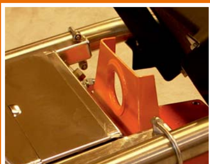
One centralized and balanced lifting eye.