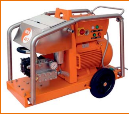
CE20-500 Super Slim