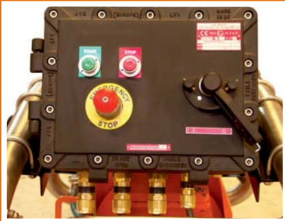
Cast electrical Ex box with main switch, star delta starter and overload relay.