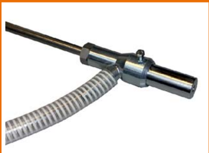
Sand Blasting Equipment