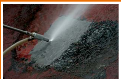
Surface - Sand blasting