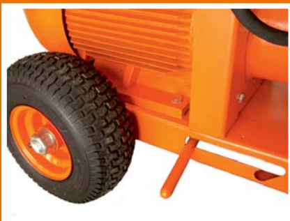
Galvanized frame with built in brake and pneumatic wheels.