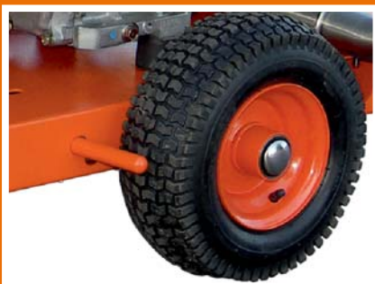
Galvanized frame with built in brake and pneumatic wheels.