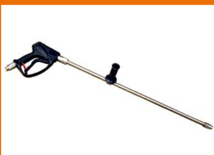
Dry-shut gun with adjustable side- handle.