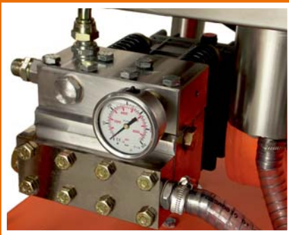
Stainless steel pump-head. Integrated unloader valve.