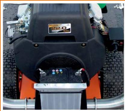
2 cylinder 4 stroke air cooled petrol engine with electrical start.