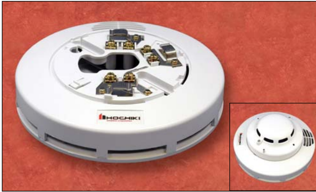
Shown without detector