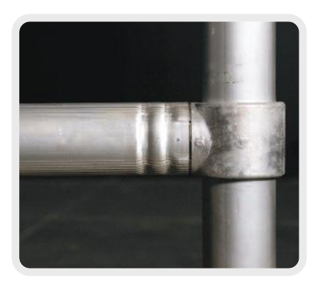
Rib-Grip - Cold Formed Joints

The cold-formed Rib-Grip jointing process is a key feature of the Instant tower system and provides three times the strength and durability of traditional welded joints. 10 year no question warranty!